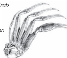
Alaska Snow Crab Section