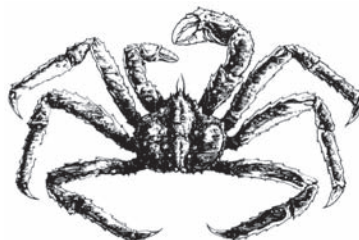
Whole Alaska King Crab